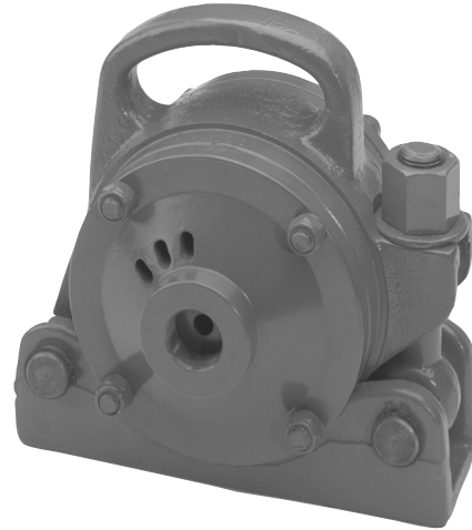
CCR Vibrator with Standard Cradle Lug Bracket

This simple, long-lasting Cougar® Vibrotor™ CCR Vibrator provides effective high-frequency vibration at an economical price. Apply to hoppers, bins, railcars, chutes, molds, screens, and tables to keep materials flowing as they should. Also great for use in pre-cast concrete applications.